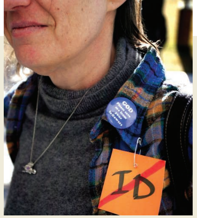
Poor design? The El Tejon class drew protests before it was canceled.

Such language is echoed in the draft Kansas Science Standards (Science, 4 November 2005, p. 754), which call on teachers to teach the evidence "for and against" evolution, as well as in the warning labels put on textbooks in